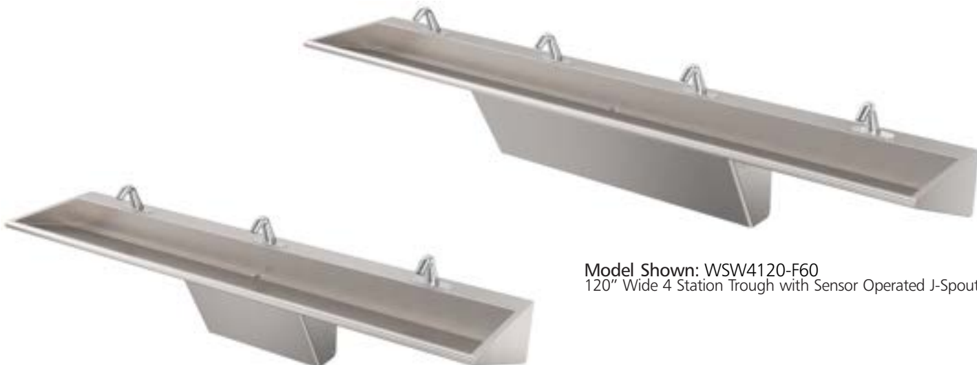
Model Shown: WSW4120-F60 120" Wide 4 Station Trough with Sensor Operated J-Spout

Additional Accessories include a Daisy (Drain) Strainer with Tailpiece and a P-Trap Assembly made of Plastic or Chrome Plated Brass.