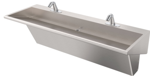
WSW260 Trough with SW00060 Faucet