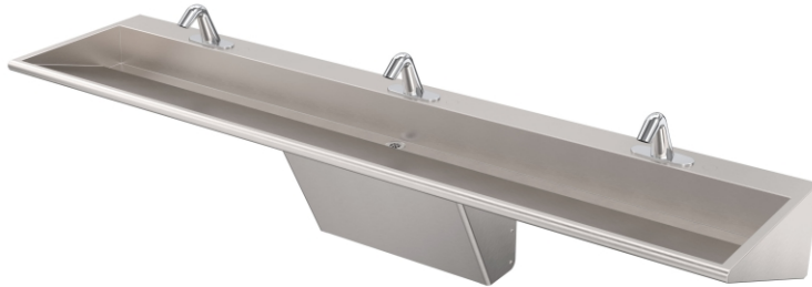
WSW390 Trough with SW000-60 Faucet